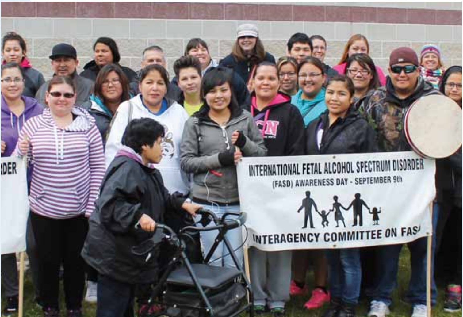
Walk participants reach their destination.

Thanks also go out to The Pas Community Renewal Corporation and the Kinsmen Club for help funding our event, Oscar Lathlin Collegiate for providing the space, the local businesses that provided lunch, and all the individuals and organizations that helped with planning the day.